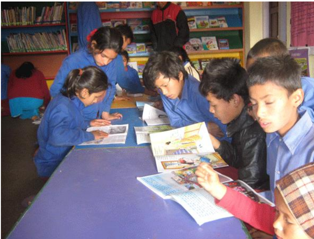
Children studying in newly constructed library.