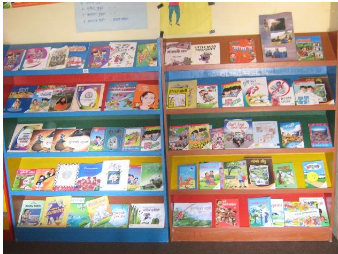
Library books provided by Room to Read on display in the rack.