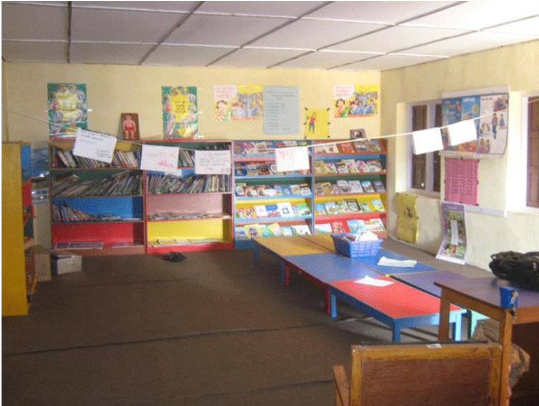
Books and materials provided by Room to Read on display in the newly constructed library.