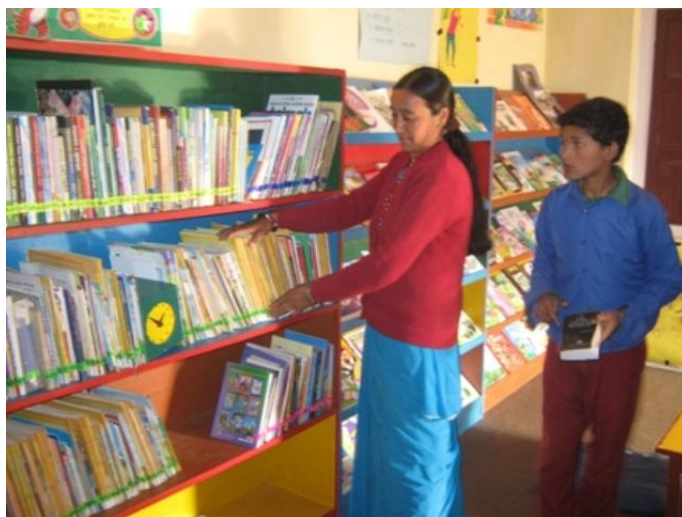
Teacher conducting library activities in newly constructed library.